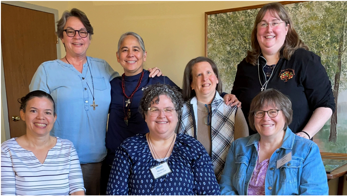
Planning team for the September 2025 gathering of sisters under 60.