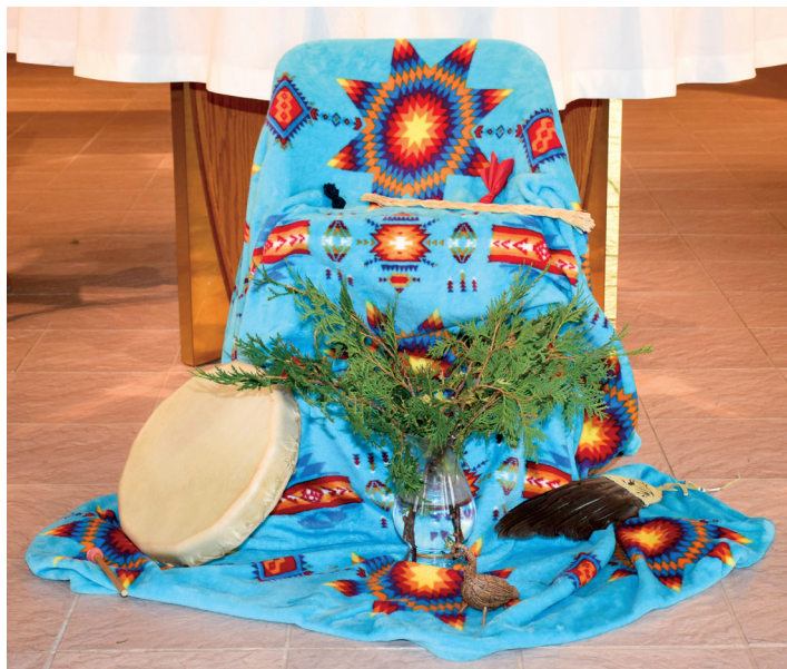
A star blanket with the four sacred plants and the hand drum.

Our Liturgy began with the playing of a traditional