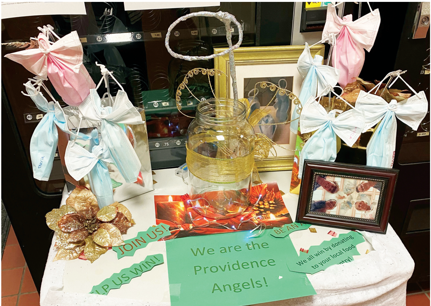
The winning Providence Angels table!

Plans are under way for 2022. Staff is already stashing pocket change, planning the next strategy.