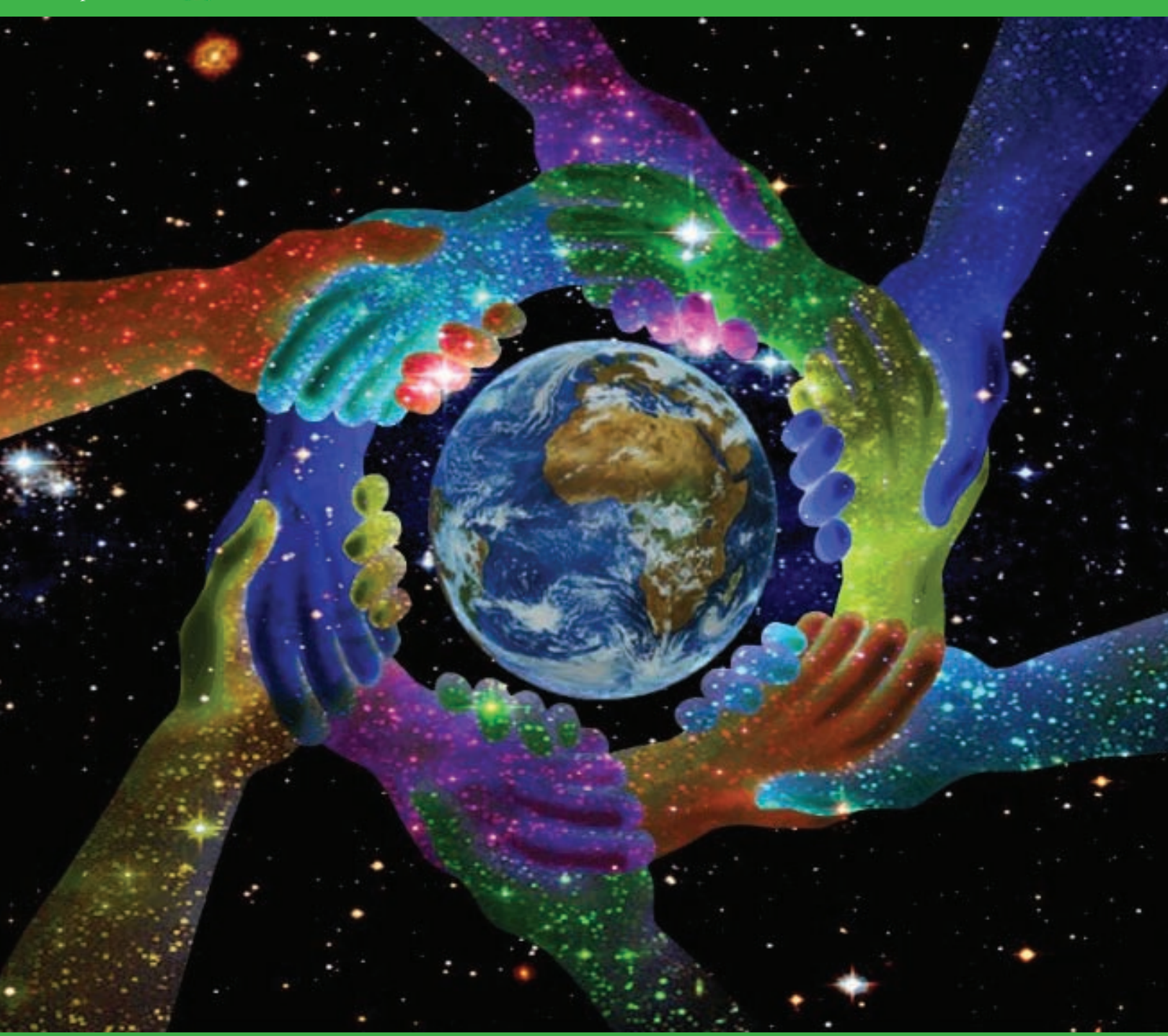
"The protection of Earth's vitality, diversity, and beauty is a sacred trust." -The Earth Charter