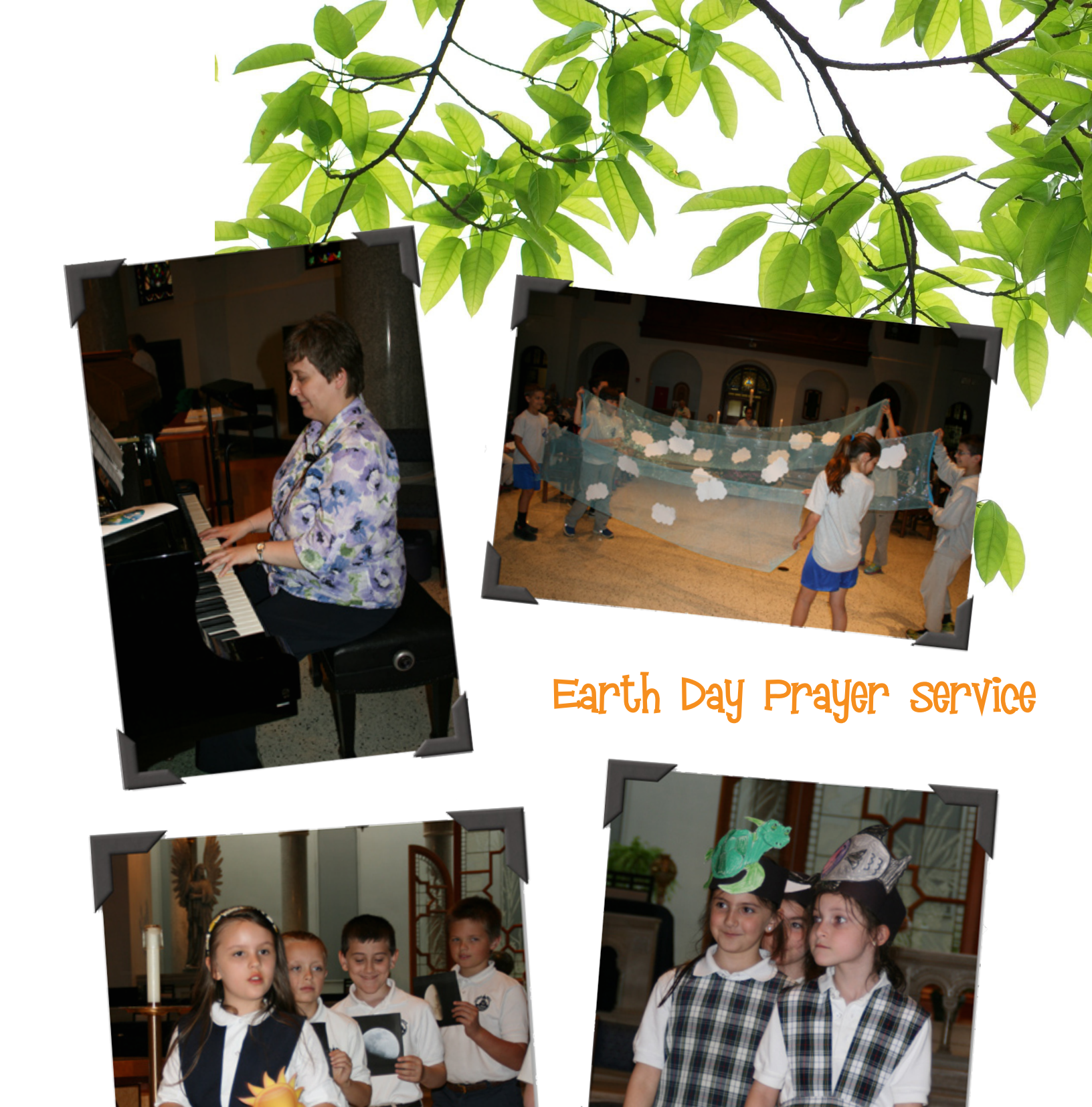
To view all the photos from the prayer service, click the Flickr icon on our website.