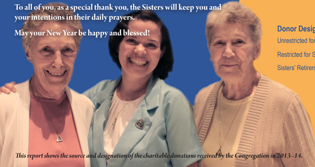
This report shows the source and designation of the charitable donations received by the Congregation in 2013-14.