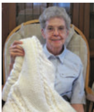
Soft white knitted afghan; original design by Sister Mary Wagner, using seed and cable stitches