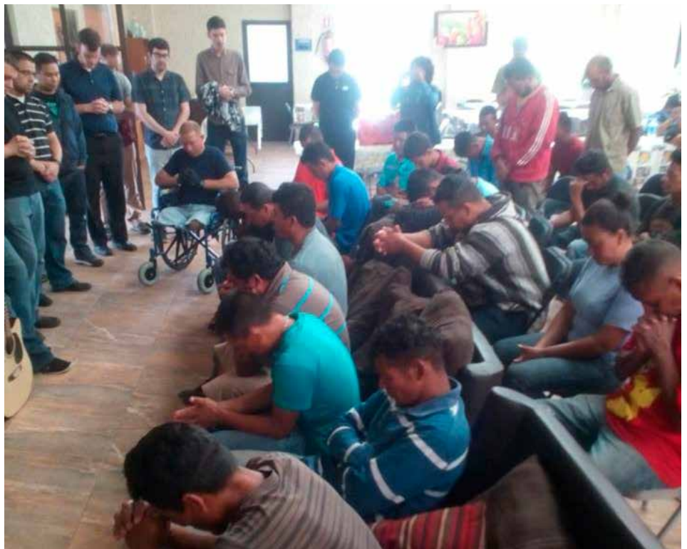
Celebration of Mass with the migrants.