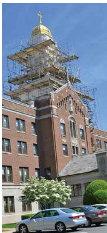
The gold dome and cross, landmarks since the building opened in 1932, sit atop Providence Place at Ingleside, the building that served the Sisters of Providence as their Mother House for some 60 years.

He further explained that the crews had to work within the Scaflite wrappings where the atmospheric temperatures inside were 20 degrees higher on any given day.