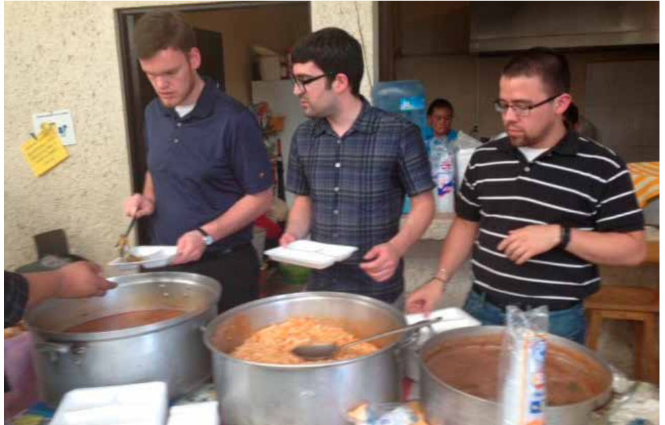
Seminarians serving lunch