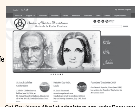
Get Providence Alive! at cdpsisters.org under Resources

We also welcome your prayer request at cdpsisters.org. Simply click on Prayer Requests.