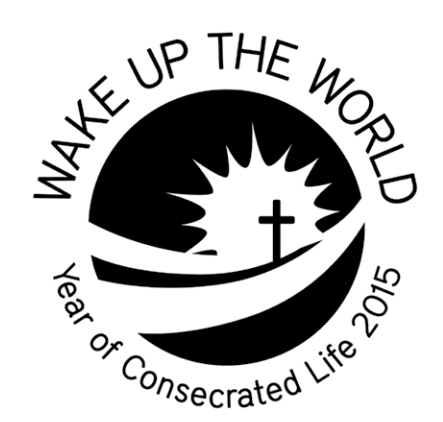
Logo used with permission of the Catholic Diocese of Pittsburgh