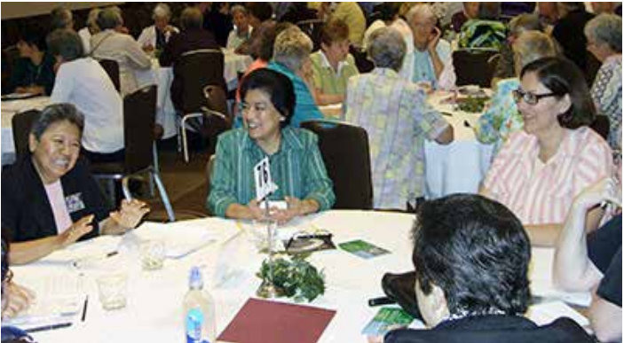
A growing number of LCWR members come from countries outside of the United States. At this assembly, there were enough members who chose to speak Spanish during conversation periods to fill three tables.