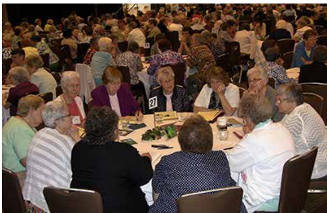
Members noted repeatedly in their evaluations of the assembly that the opportunities for conversation and reflection together were among the most invaluable parts of the assembly experience