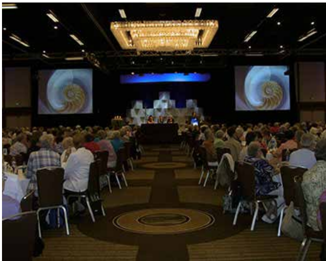
Members listen to speakers in the assembly meeting space in Houston, Texas

Approximately 800 LCWR members and associates came from all parts of the United States and other countries for the annual LCWR assembly held in Houston, Texas under the theme of “ Springs of the Great Deep Burst Forth: Meeting the Thirsts of the World. ” Highlights from the four days of activities are summarized here.