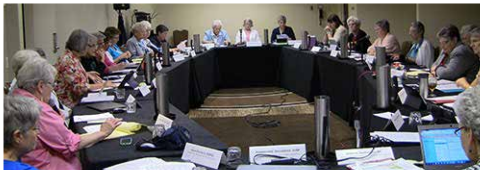
LCWR national board and staff at post-assembly board meeting in Houston