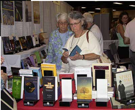
Participants visited the approximately 100 exhibitors during the assembly.