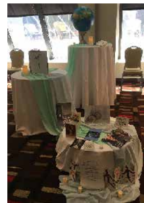
“A Space to be in Communion with the World” was utilized for personal and communal contemplation