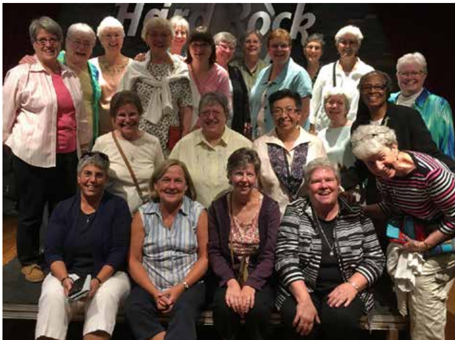
Members of the LCWR national board and staff enjoy an evening out during the board meeting in Atlanta