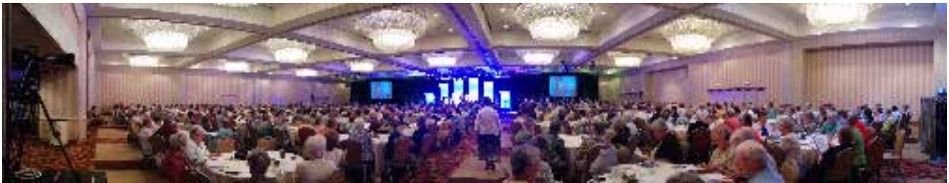
Nearly 800 people participated in the 2016 LCWR assembly in Atlanta, Georgia