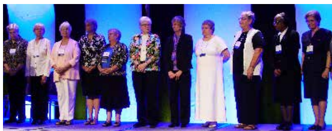
The assembly blesses the members of the 2016-17 LCWR national board