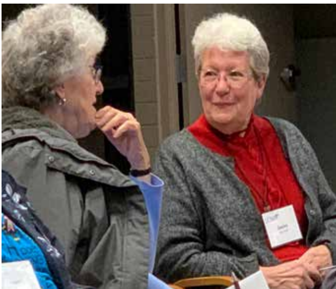
This new effort will explore collaborative and creative ways to meet the shifts unfolding in religious life

The conference thanks all the leadership teams who completed and returned the form sent in November requesting information. The response has been remarkable with a very high measure of interest and participation. Any congregation that did not return the form (asking for data on each institute) is asked to do so as soon as possible so that the national profile that LCWR generates is as accurate and complete