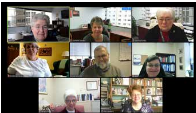
The emergent planning process has included focus groups conducted via videoconferencing with a wide variety of participants