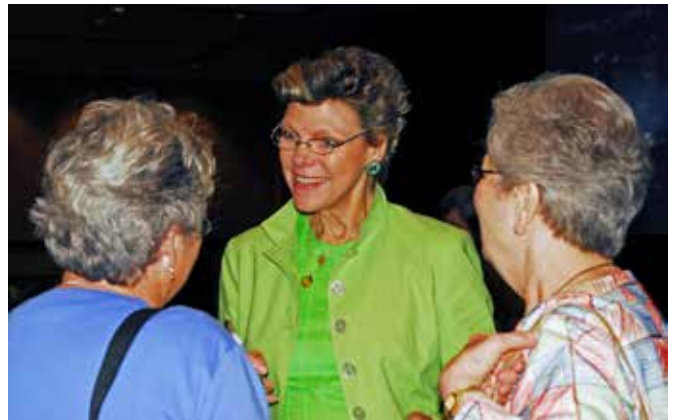
Cokie Roberts greets LCWR members at the conference's 2009 assembly held in New Orleans

More information and registration materials can be found at lcwr.org/calendar/leading-within .