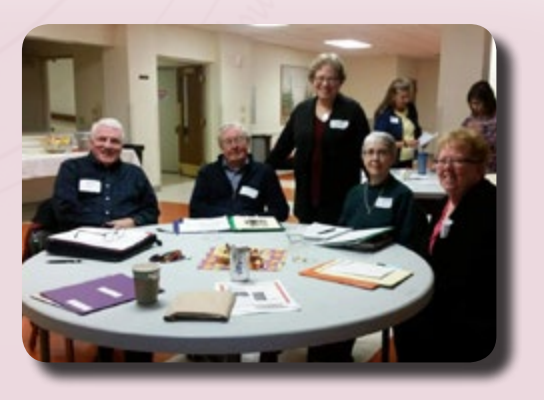
From left: An activity at the leader retreat illustrates our global presence; members of BACAR discuss topics important to the associate-religious movement; Sisters of The Humility of Mary, religious and associates, gather last October.

The NACAR board will also be seeking feedback on our belief-commitment-action statements (see page 13) in preparation for NACAR's 25th anniversary in 2021.