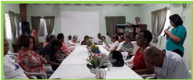
Santo Domingo Associates pause for prayer as they gather in December to celebrate and share a meal.