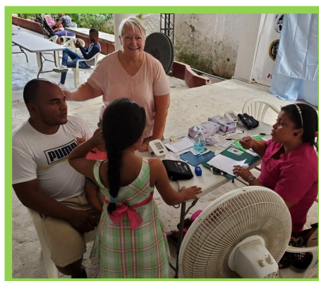
Day 4 at the triage table.