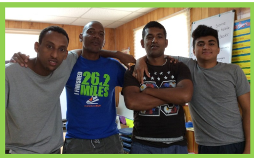
Young legal refugees from Somalia, Cuba, Pakistan, and Honduras