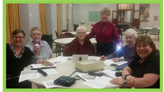
Strategic Intent Committee on Fostering Communal Relations

Time was provided for quiet personal reflection, followed by an open-microphone session for individual comments. Hard questions were posed throughout the day to help us discover and acknowledge our collective shadow so we could collectively walk into the light. The program closed with expressions of acceptance and gratitude for our time together and the discoveries we had shared.