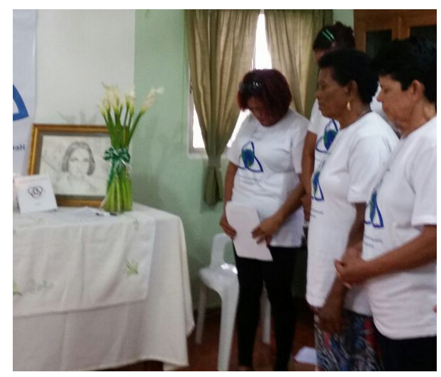
New Associates in Santo Domingo reflect during a day of retreat