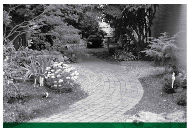
The beautiful grounds include a meditation garden, gazebo and woodland reflection trail.