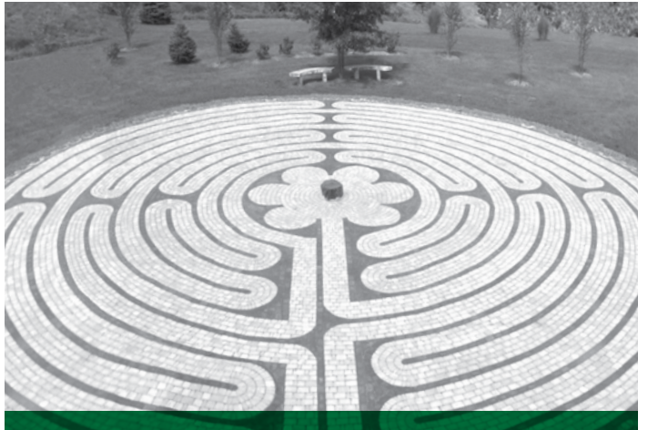
Walking on the brick-inlayed, outdoor labyrinth is an alternative way to pray and meditate.