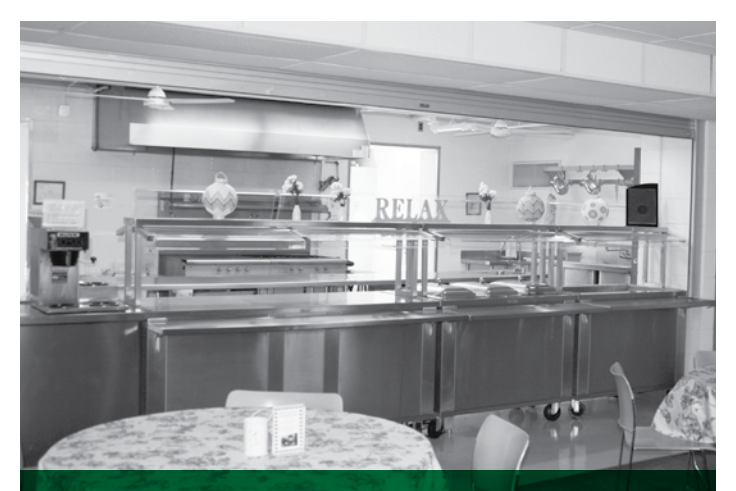
The accessible kitchen and dining room are fully equipped with seating for up to 70 guests.