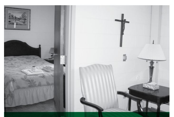
Up to 60 overnight guests can be accommodated in 27 guests rooms and suites.