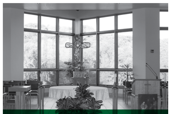
Visitation Chapel offers quiet solitude 24/7 and seating for up to 200 guests.