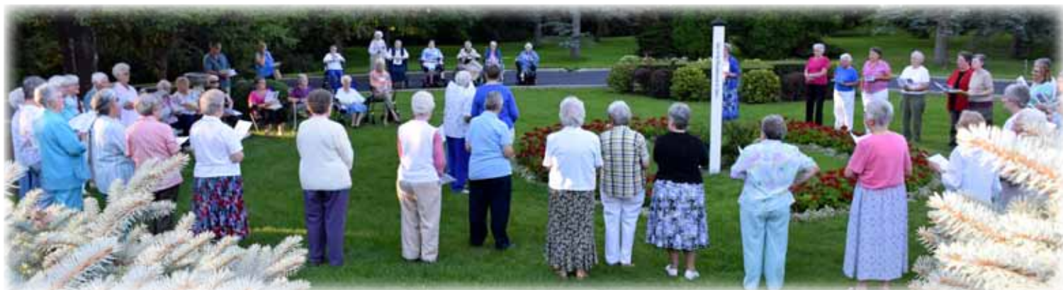
Late this past summer, Sisters of Providence of St. Vincent de Paul and friends gathered at their Motherhouse in Kingston to dedicate a peace pole installed in their front circle. The pole is inscribed in four languages: English, French, Spanish and Cree. It says May Peace Prevail on Earth.