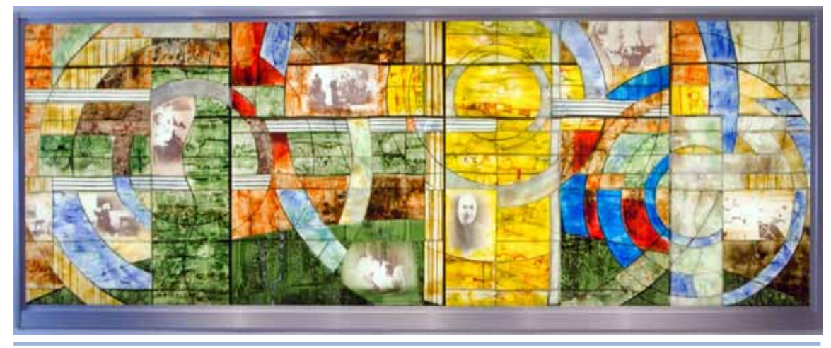
The stained-glass artwork recounts the history of the Sisters of Providence.

began the religious community in 1843 in Montreal, Quebec, Canada. The piece is a gift from the leadership of Providence Health & Services to the Sisters of Providence and all the caregivers of Providence. It was inspired by the stained-glass mural in the Providence International Centre in Montreal.